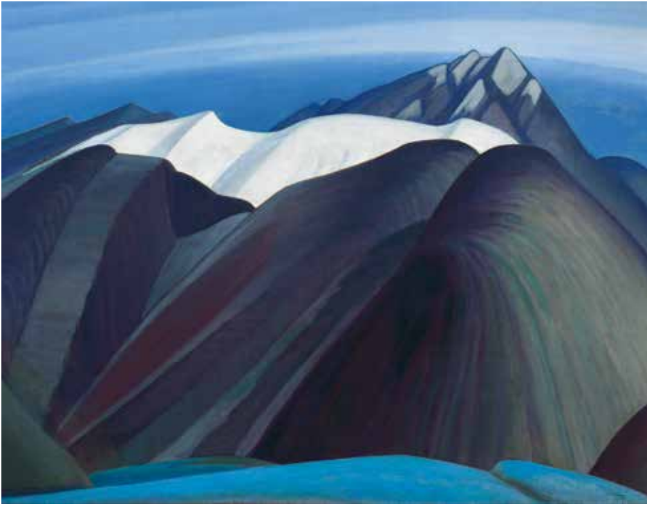
ABOVE: LAWREN STEWART HARRIS Mountains East of Maligne Lake oil on canvas, 1925, 40 ½ x 52 ¼ inches Sold November 22, 2017 for $3,001,250